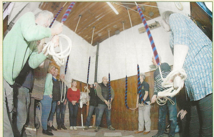
The bells ring out for the first time – the additional bells originally came from Kent and Liverpool