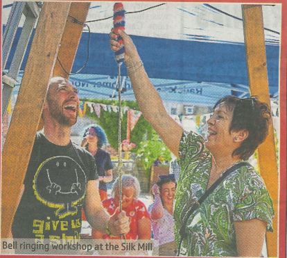
Bell ringing workshop at the Silk Mill