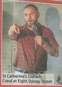
St Catherine's Comedy Crawl at Eight Stoney Street