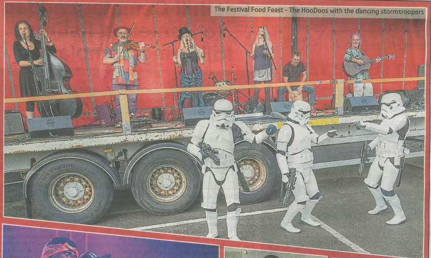
The Festival Food Feast - The HooDoos with the dancing stormtroopers