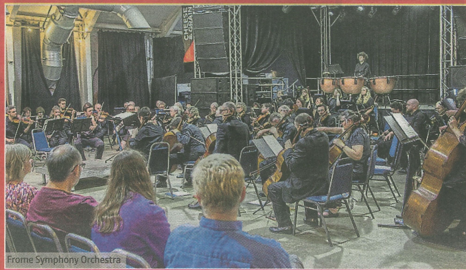
Frome Symphony Orchestra