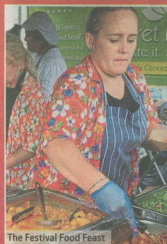
The Festival Food Feast