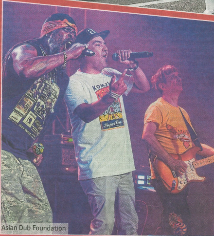
Asian Dub Foundation