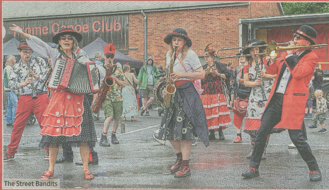
The Street Bandits