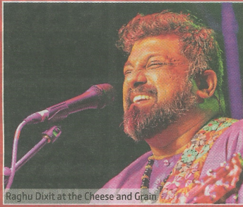
Raghu Dixit at the Cheese and Grain

THE ever-popular Frome Festival proved once again as thousands of people descended on the town for the ten-day celebration of music, culture and arts.