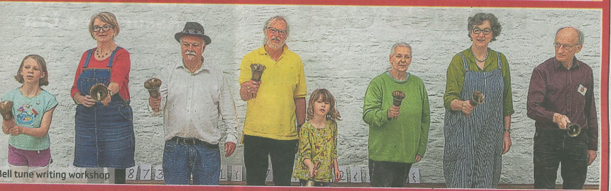
Bell tune writing workshop